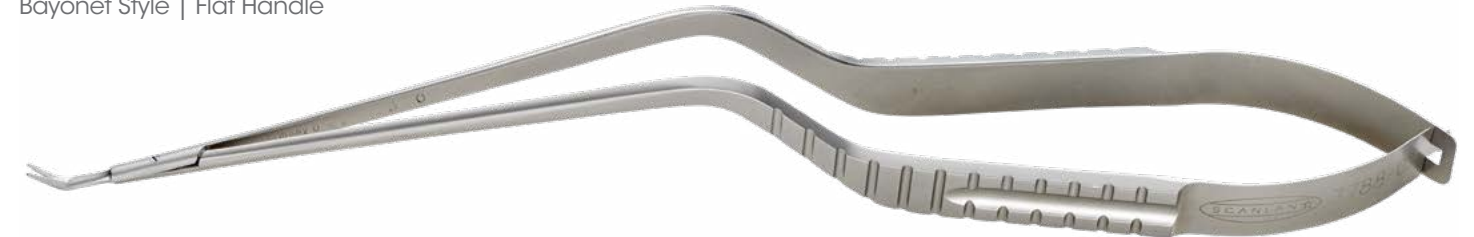
SCANLAN® Micro Scissors, Stainless Steel

SCANLAN® Micro Scissors Bayonet Style | Flat Handle