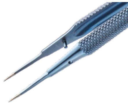
0.3 mm Gerald Type Taper Straight Forceps