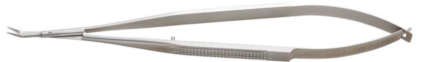
Instrument is shown approximate size