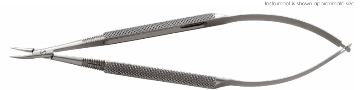
Instrument is shown approximate size