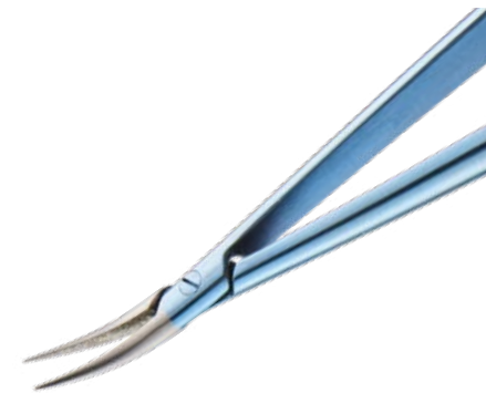
0.3 mm Curved Needle Holder