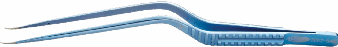
SCANLAN® Micro Forceps, Titanium