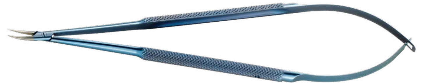
Instrument is shown approximate size