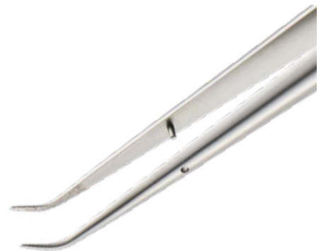
0.3 mm 45° Tying Forceps