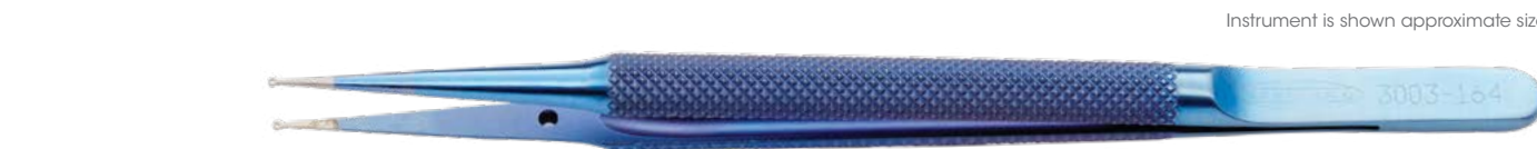
Instrument is shown approximate size