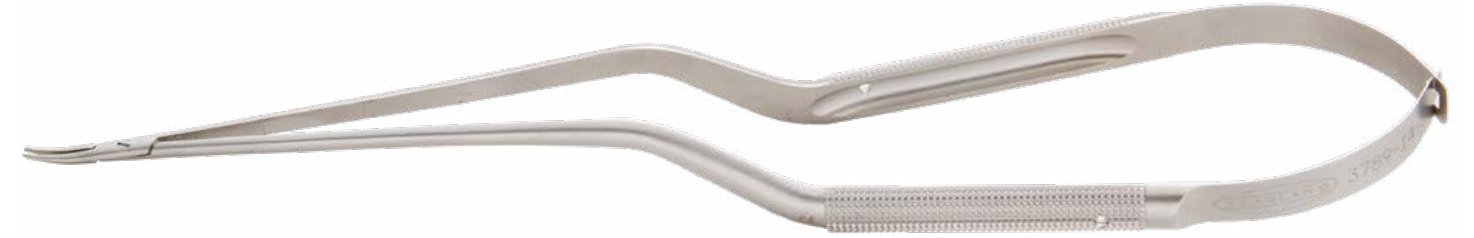
SCANLAN® Micro Needle Holder, Stainless Steel

SCANLAN® Micro Needle Holders Bayonet Style | Round Handle