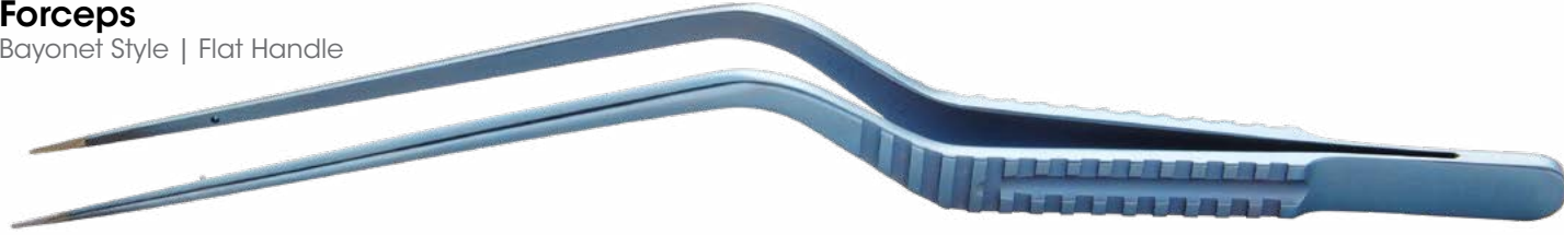
SCANLAN® Micro Forceps, Titanium

SCANLAN® Forceps Bayonet Style | Flat Handle