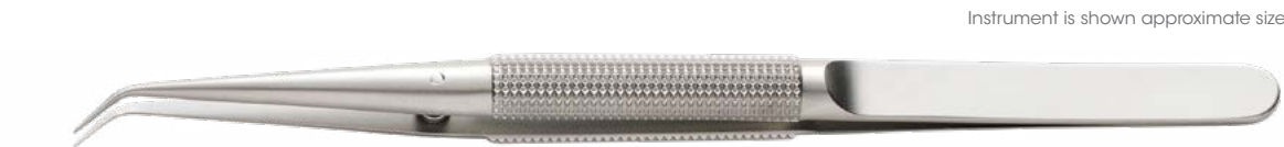
Instrument is shown approximate size