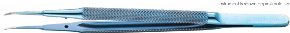
Instrument is shown approximate size