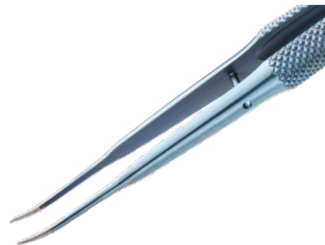
0.3 mm Gerald Type Taper Curved Forceps