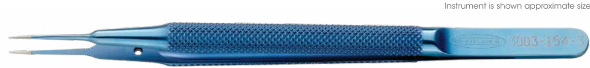
Instrument is shown approximate size