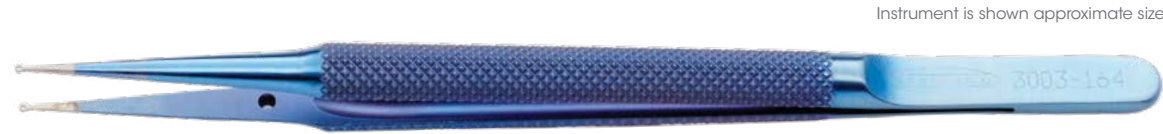
Instrument is shown approximate size