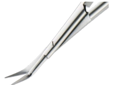
45° Vannas Micro Scissors