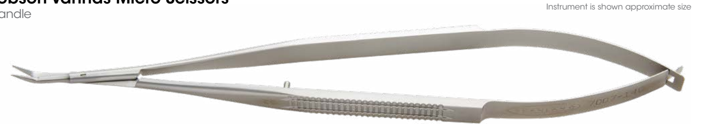
Instrument is shown approximate size