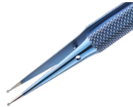
1 mm Ring Tip Forceps